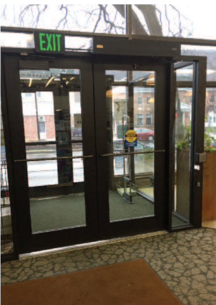
Redesigned front entrance