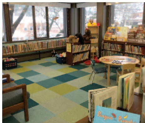
New carpeting and lighting in the Children's Room