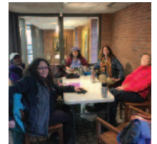
New Mezzanine level small meeting space being utilized by Brattleboro Time Trade group