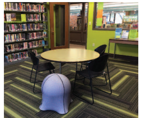
New Teen Room