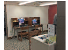
New computer station corner