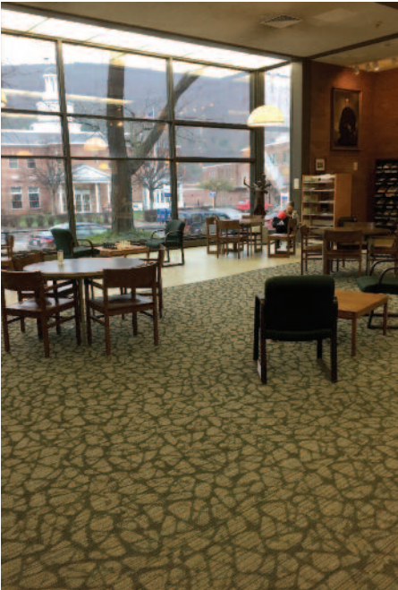
Main floor with new flooring and redesign

THE RENOVATIONS are finally completed at the Library. The last work was done during the week of March 20. The Library was closed for the week so that new flooring could be installed on the Main level.